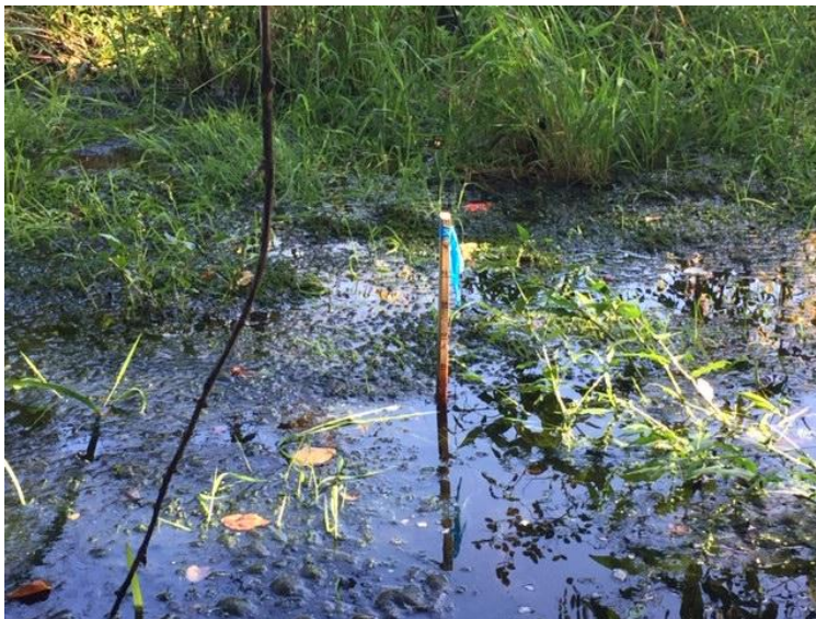
Station 5.4 (Whalen Property) – Turbidity readings taken at all substations on Whalen property. Stations similar to previous events. (9/5/2019)