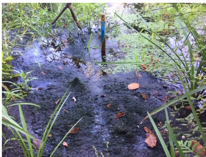
Station 5.5 (Whalen Property) – Station similar to previous monitoring events. Higher turbidity than previous events. (9/13/2019)