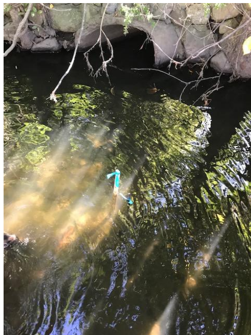
Statio 2 (West Street) – New stakes installed for sediment monitoring during drawdown. (9/13/2019)