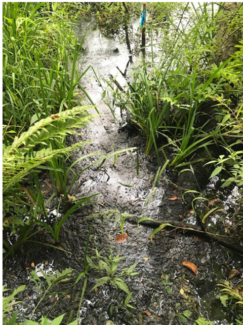
Station 5.5 (Whalen) – Additional sediment building near fallen tree at station 5.5 on Whalen property. (8/23/2019)