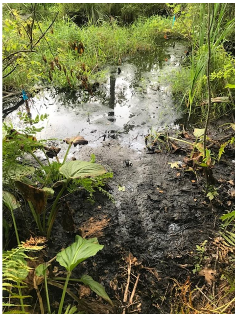
Station 5.2 (Whalen) – Sediment building along bank at Station 5.2 on Whalen property. (8/23/2019)