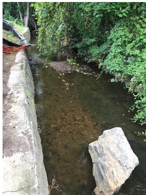
Station 1 (Petrini Apartments) – Station 1 appeared similar to previous week's visit. Flow of brook at higher velocity than previous monitoring; however, it was noted that it had rained the night before monitoring. (8/23/2019)