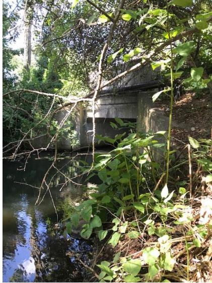
Central Avenue Culvert – Outfall water sample collected at the Central Avenue Culvert on 9/16/2019.