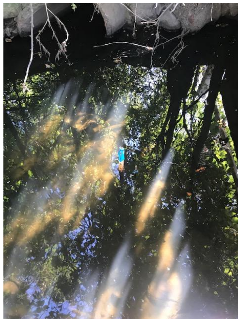
Statio 2 (West Street) – Monitoring and water sampling took place at Station 2 on 9/16/2019.