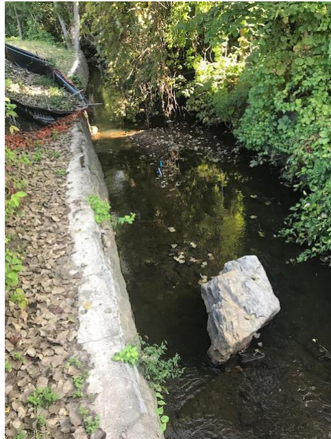
Station 1 (Petrini Apartments) – Monitoring and water sampling took place previously at Station 1 on 9/16/2019.