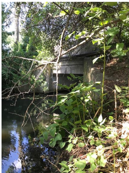
Central Avenue Culvert – Outfall water sample collected at the Central Avenue Culvert. (9/16/2019)