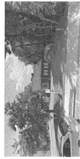
1180 Great Plain Ave Needham, MA 02492