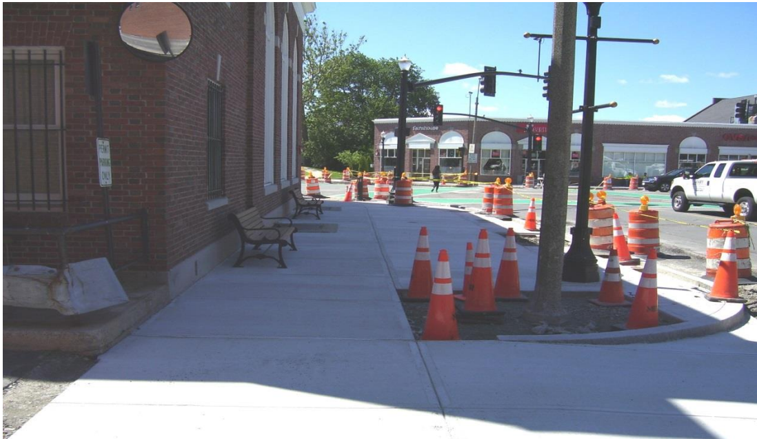
Completed concrete sidewalk in Highland Ave. in front of Santander Bank showing new benches