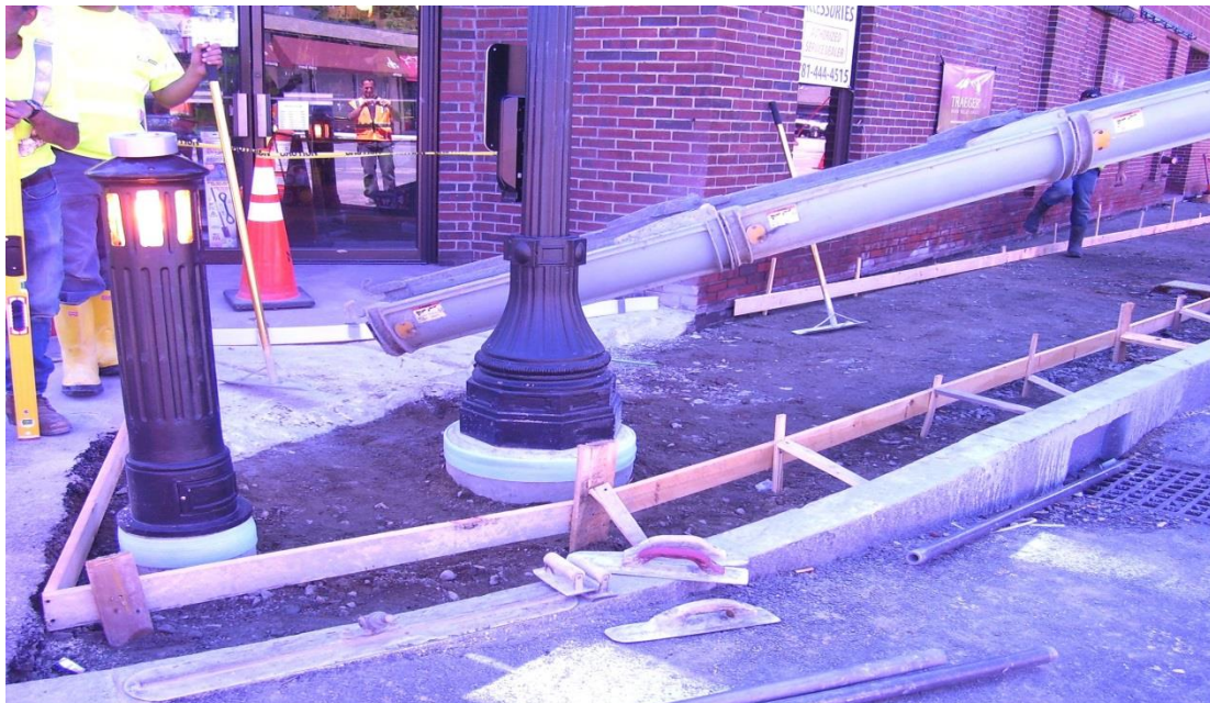
Beginning installation of concrete sidewalk in front of Harvey's Hardware