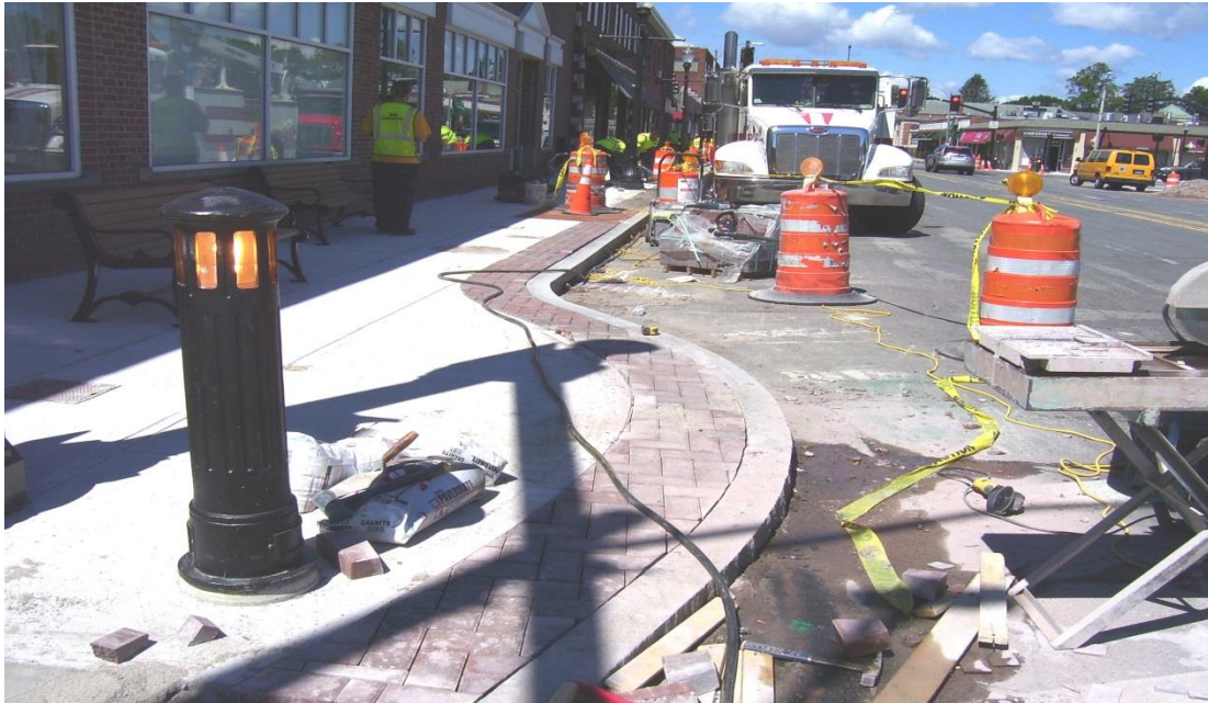
Brick strip being installed on the south west corner of Great Plain Ave. and Dedham Ave. in front of Hearth Pizza