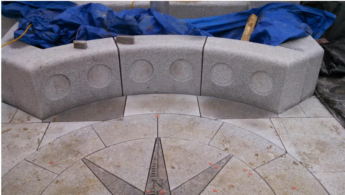
Granite pavers between the flagpole planter and granite compass