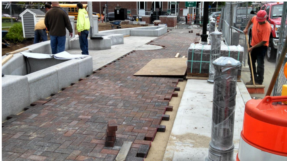
Granite seat wall and brick and granite pavers being installed in front of the Common