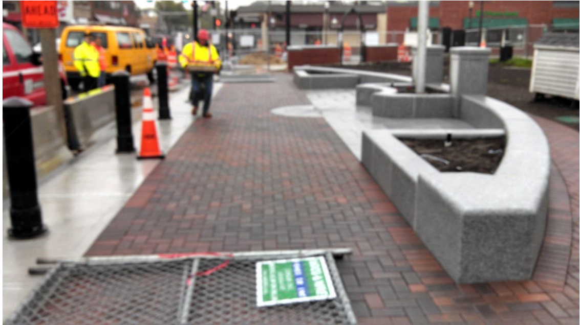
Area in front of the Common with pavers nearly complete and planters ready to accept plant material