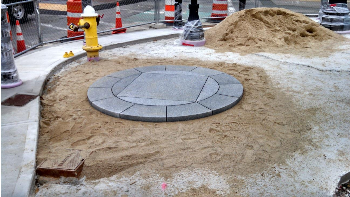
Granite pavers installed over future kiosk foundation on the west end of the Common