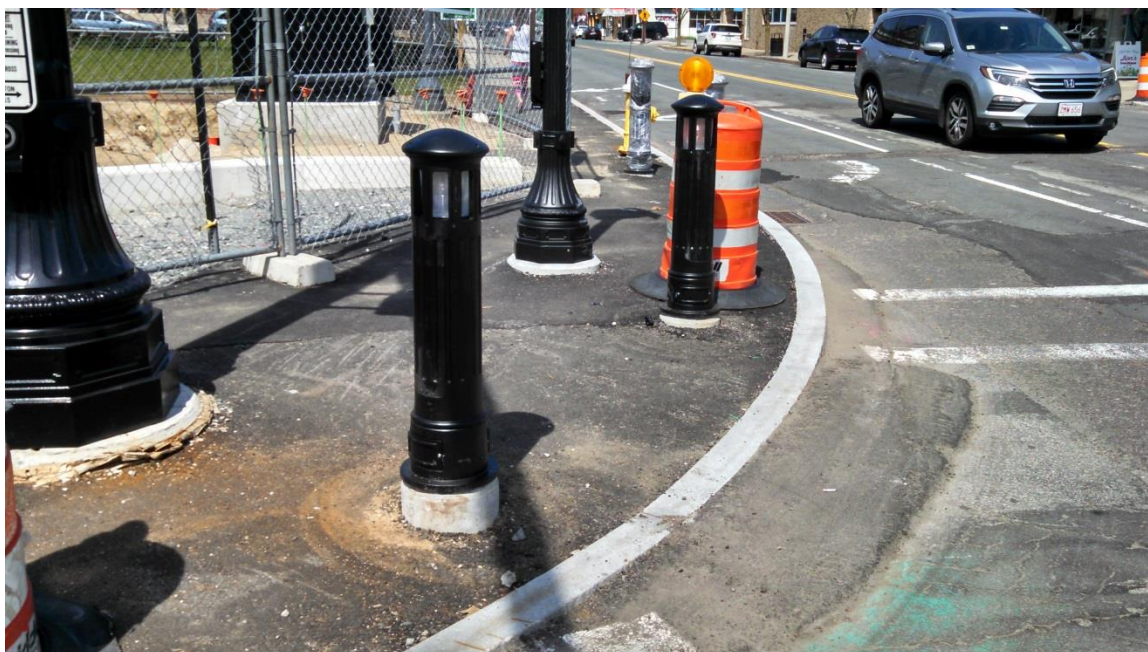
Lighted bollards installed on the northwest corner of Highland Ave and Great Plain Ave