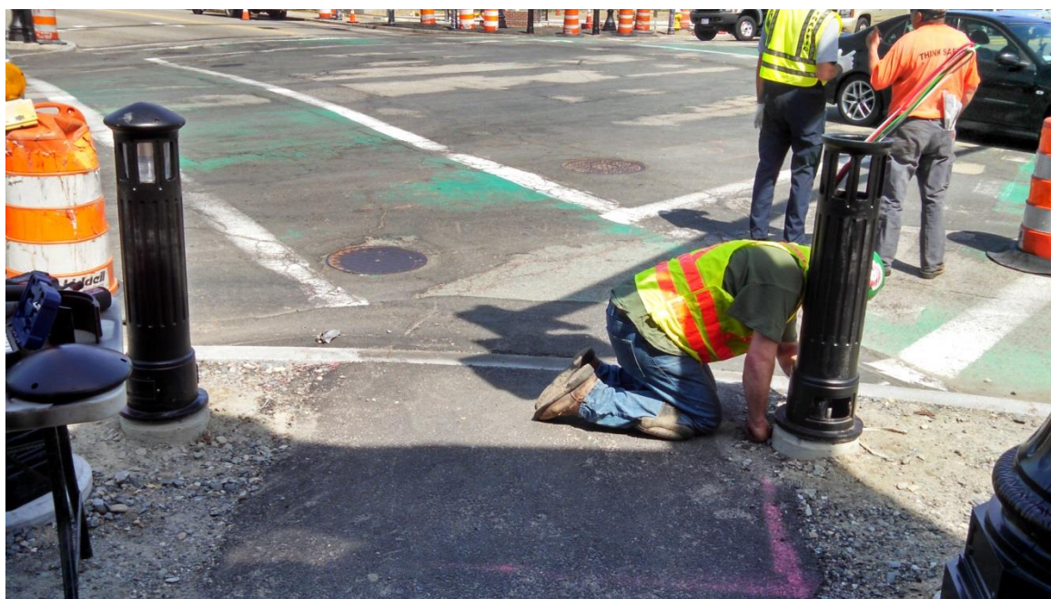
Lighted bollards being installed on the southwest corner of Chestnut St and Great Plain Ave