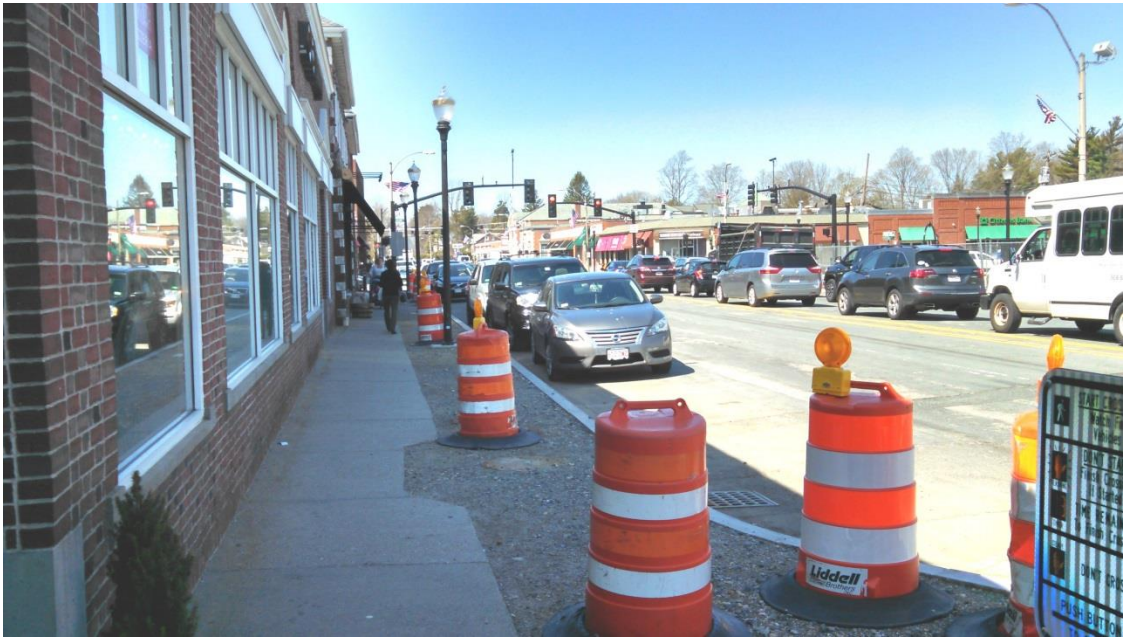
New street lights installed on the south side of Great Plain Ave across from the Common