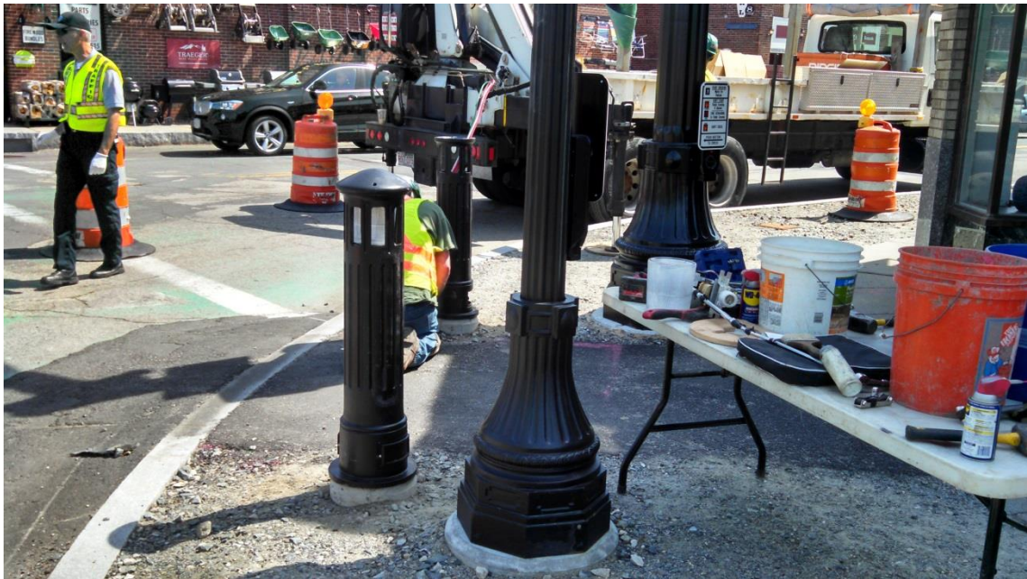
Lighted bollards being installed on the southwest corner of Chestnut St and Great Plain Ave