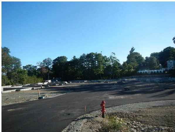
Site conditions 10/4/16