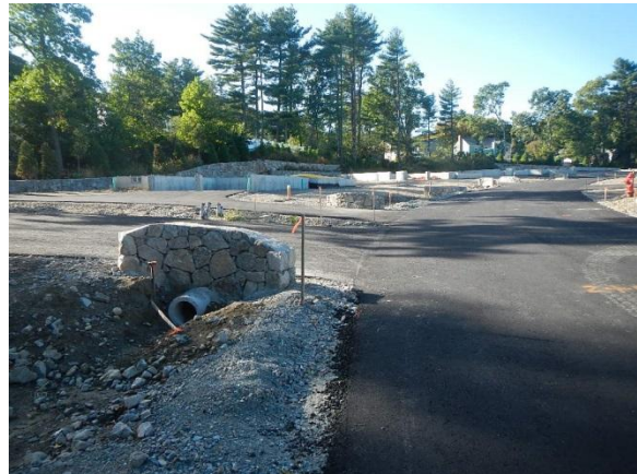
Site conditions 10/4/16