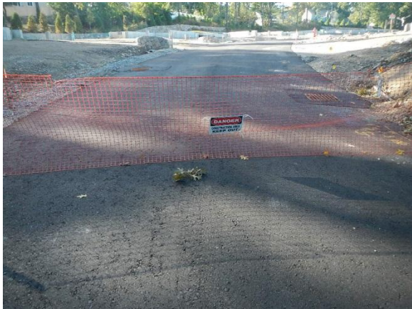
Site conditions 10/4/16