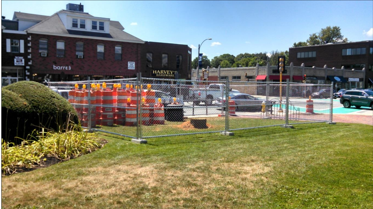
Temporary fencing for lay down area on Common 8/3/16