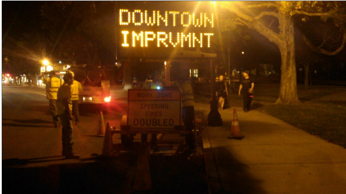
Message board and warning sign at east end of project on Great Plain Ave. 8/1/16