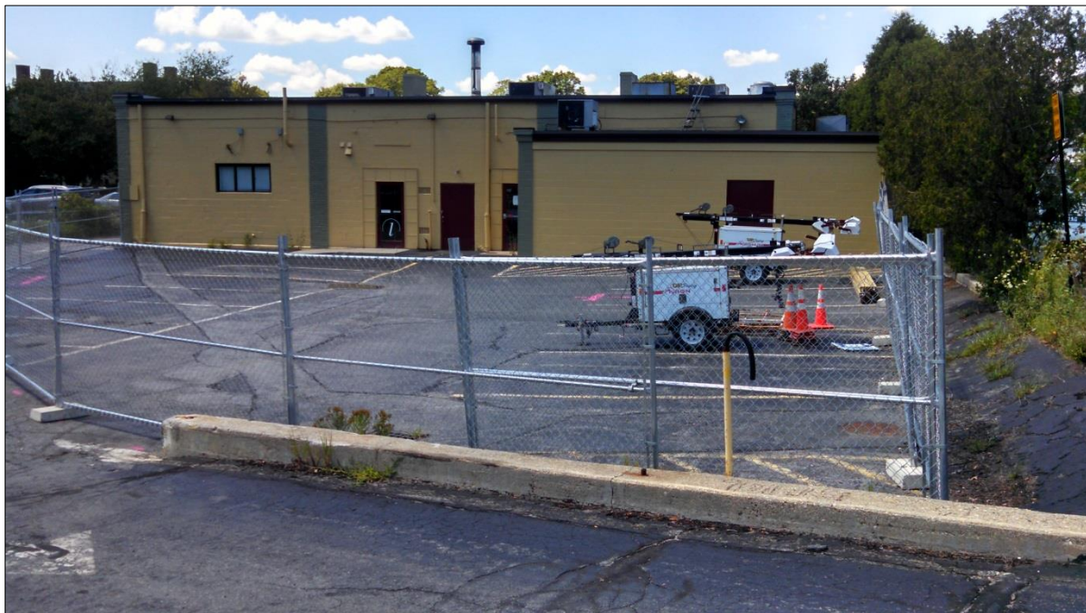
Temporary fencing for lay down area behind 66/68 Chestnut Street 8/3/16