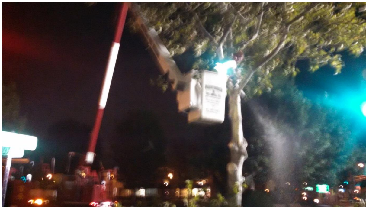
Removing branches of tree on common from bucket truck 8/1/16