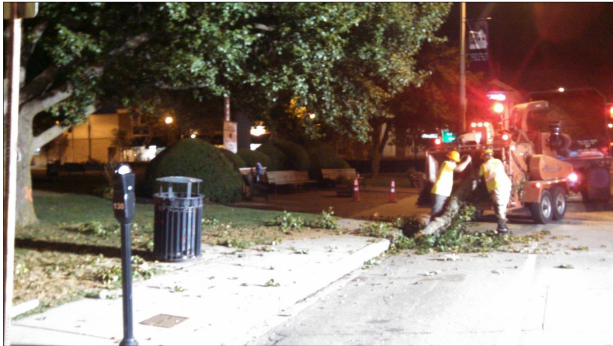
Feeding branches of tree from common into chipper 8/1/16