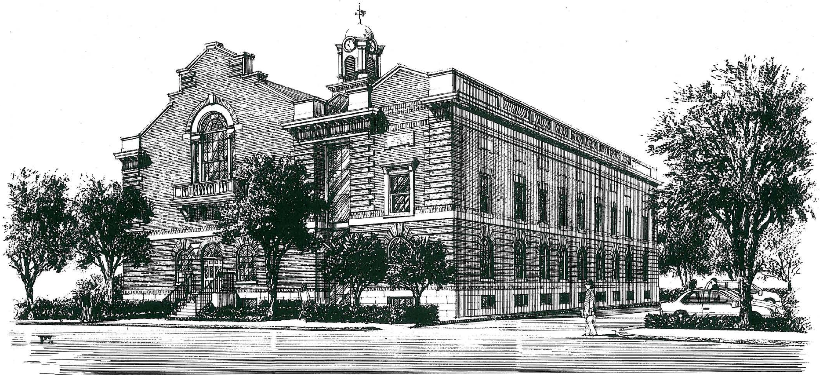
HIGHLAND AVENUE PERSPECTIVE FROM NORTHEAST